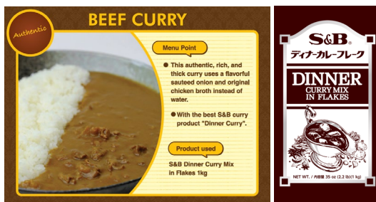
BEEF CURRY made with DINNER CURRY FLAKES 1kg (Product for export)

Visitors can enjoy the following tastings at S&B Foods’ booth.